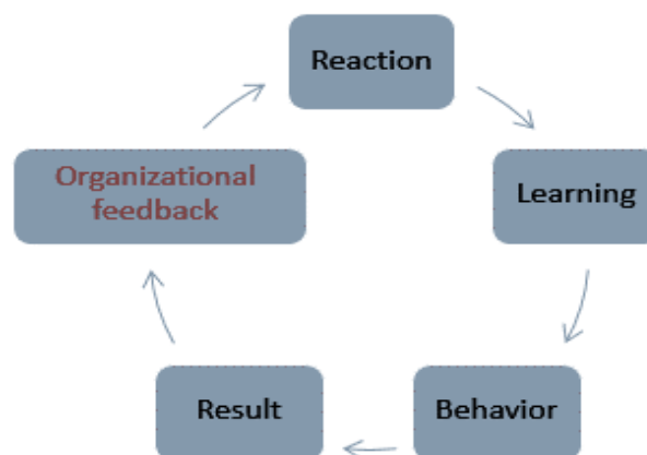
Figure 3: The Summary of Research

prominent model so far. In this study, in addition to the common methods of evaluating in-service courses which have been limited to surveying the participants and using questionnaires, based on the pattern of change in learning, the resulting behavior and outcomes of training the teachers were evaluated in their work environment and the areas which needed improvements were addressed in the study. One of the reasons for the importance of this study was planning to prevent wastage of organizational resources and interests by examining the quality of the provided trainings at different levels of evaluation; which means that according to the provided trainings, the evaluation levels and the conceptual research model, it turned out that if the teachers under training provide more responses, the learning will take place better; and it will enhance the teacher's ability and skill, mastery, and performance, and it was found that the level of behavior has a positive impact on the teacher's organizational results and the productivity resulting from his performance. However, due to the time constraints of training courses and the presence of influential factors in organizational definitions and the researcher's inability to make organizational decisions to create a competition and rank the teachers' activities, upgrading the conceptual model and turning it into an evaluation cycle did not become possible.